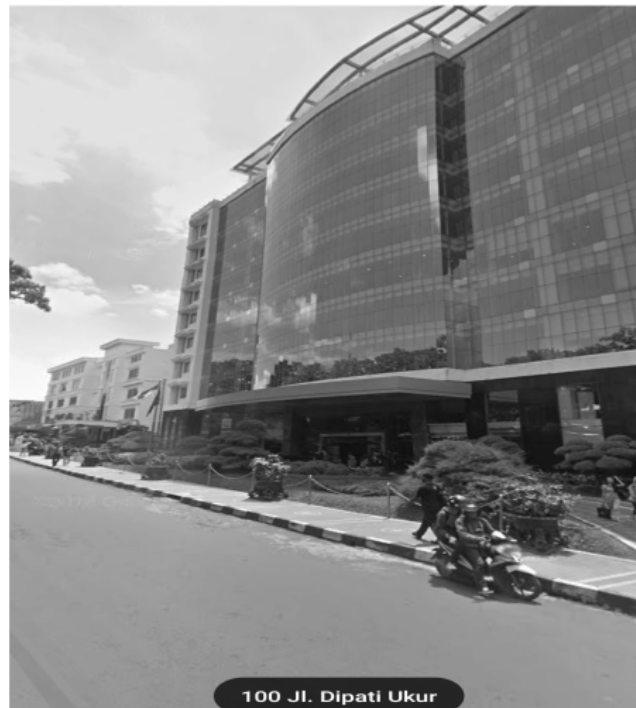
Fig. 2. Location study, Dipatiukur street.

In this study we conducted research by measuring several parameters (CO, CO 2 , PM1, PM2.5, and PM 10 ) before and after rain. The aim of this is to see whether the rain impacts the content of particulates in the area, so that the results of this study can be seen on whether rain can reduce its levels or not. To support this research we also counted the number of vehicles that passed in that time period. As a model we chose Bandung as a research place as one of the big cities in Indonesia and a tourist city. The choice of Dipatiukur is deemed valid as the location because it is a busy road due to the existence trade, education, and other economic activities in the area and it is the road to the tourist location of Monument Perjuangan and an alternative road to Gedung Sate.