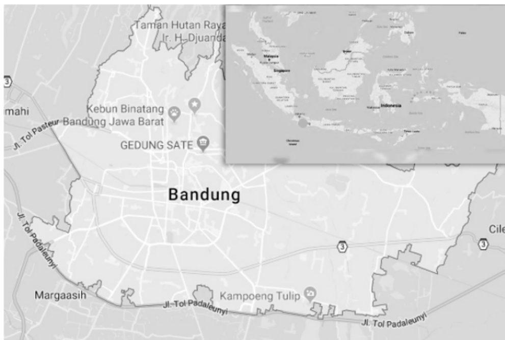
Fig. 1. Location of Bandung.

This research was conducted on March 30, 2019, starting at 6:30 a.m. - 1:40 p.m. (Indonesian time) with the time span of each hour taking existing data. We conducted this research with 3 tools, namely, HT-200 (CO 2 meter), air quality monitor, and Benetech GM8805 (carbon monoxide monitor). This research was conducted in the city of Bandung, precisely on the street along the University Computer Indonesia campus. So this research takes 2 points of traffic, one headed for upper Dago and another headed for Monument Perjuangan (see Figures 1 and 2).