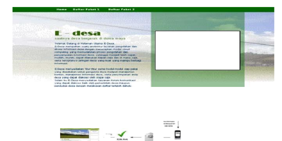
Fig. 2: Village registration form page

Prosocial behavioral effects. In this case, it means that the community has the will and ability to using online facility of E-desa. However, the behavior stagirig should be preceded by awareness, knowledge and a good understandirig of online E-desa facility. In Bandurig, media and communication facilities such as television, radio, telephone (or mobile phone), newspapers, books, magazines and so on have reached the capital of villages. In addition, in Bandung regency there are also social groups and rural economic institutions such as school, saving and credit cooperation, rural banks, village barris, agricultural supply stores and other non-formal institutions.