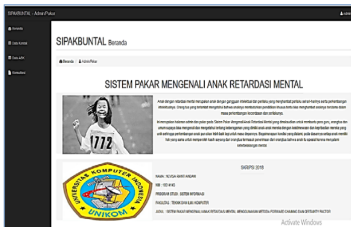
Fig. 4. Expert system main menu.