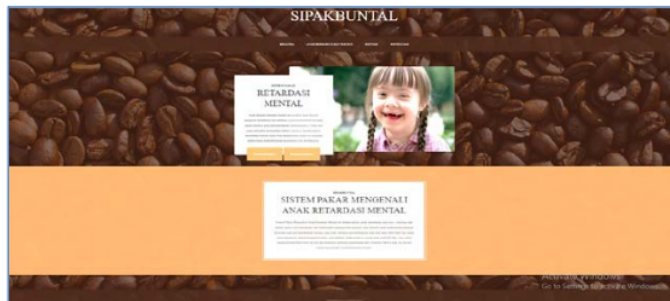
Fig. 3. Expert system welcome screen.

There are some GUI to help the user that aim to assess their children. We showed two examples of GUI for front-end GUI in Fig. 3. and back-end GUI in Fig. 4. We created the form of interaction in order to enter one or some criteria into the system, it is shown in Fig. 3. Every form has a responsibility to serve the user. We divided the user into two criteria namely general and expert user. A general user is a teacher who uses the system to measure the level of children retardation. Meanwhile, an expert user is responsible to add new knowledge and repair the system if the system crash.