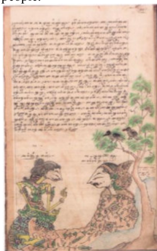
Figure 1. Illustration of Nyi Sri Pohaci (Dewi Sri) and Budug Basu in Ancient Manuscript Ksatriya Budug Basu.