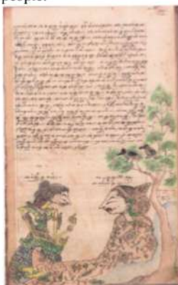
Figure 1. Illustration of Nyi Sri Pohaci (Dewi Sri) and Budug Basu in Ancient Manuscript Ksatriya Budug Basu.