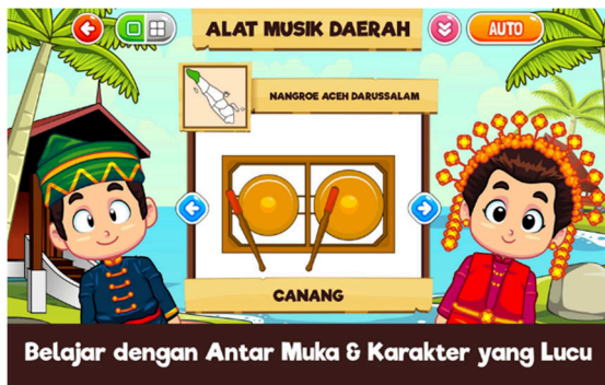
Figure 3. Educational game content.