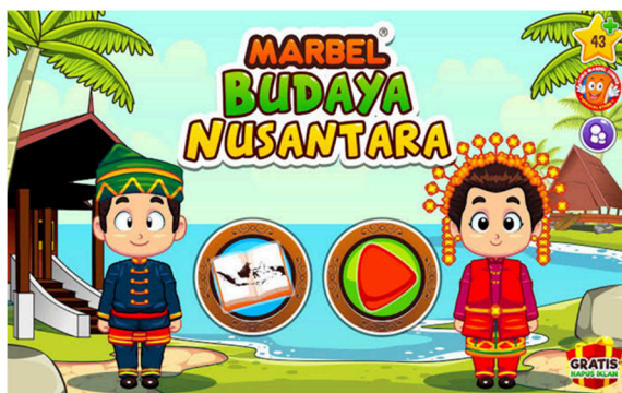
Figure 4. Cover of Education Game

In the final stage of the branding process that must be prepared to communicate the brand value and the right positioning to consumers, which must be supported by the existence of the right concept. The development of concepts designed for a brand is a process that requires creativity because it is different from just positioning, the concept can continually change because of its dynamic nature that conforms to the renewal of the product that the customer wants to instill. A good concept has an implementation to communicate the elements of brand value and the right positioning so that the brand image can be improved continuously (see Figure 4).