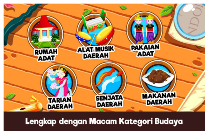
Figure 2. Main Menu Education Game

Positioning the right brand in various ways, such as placing the position of a product in detail and more specifically for the customers. Building and developing positioning is putting all aspects of brand value as a part of the functional benefits that are consistently applied. The purpose is to make brands always become number one in the minds of consumers, especially customers. In this study, the position created is the position on the perceptions of consumers where products are for children, with brand value as an educational tool packed in e-learning games by getting to know Indonesian culture in a fun way (see Figure 2).