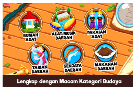
Figure 2. Main Menu Education Game

Positioning the right brand in various ways, such as placing the position of a product in detail and more specifically for the customers. Building and developing positioning is putting all aspects of brand value as a part of the functional benefits that are consistently applied. The purpose is to make brands always become number one in the minds of consumers, especially customers. In this study, the position created is the position on the perceptions of consumers where products are for children, with brand value as an educational tool packed in e-learning games by getting to know Indonesian culture in a fun way (see Figure 2).