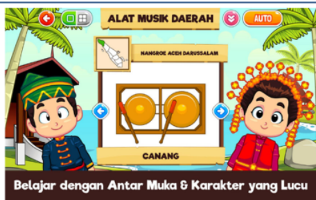
Figure 3. Educational game content.