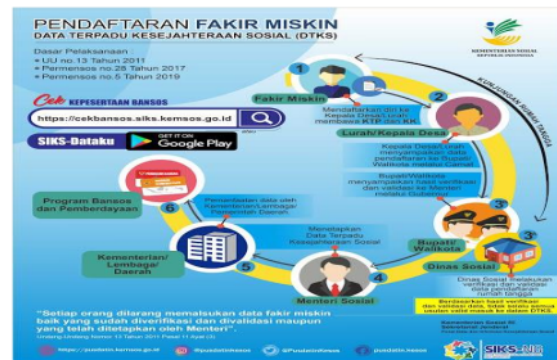
Figure 4: The display of Procedure for Data Collection through SIKS-GS.

Periodic updating of data by district/city Social Services through SIKS-NG distributes the social security fund to the right target, in the right amount, and at the right time.