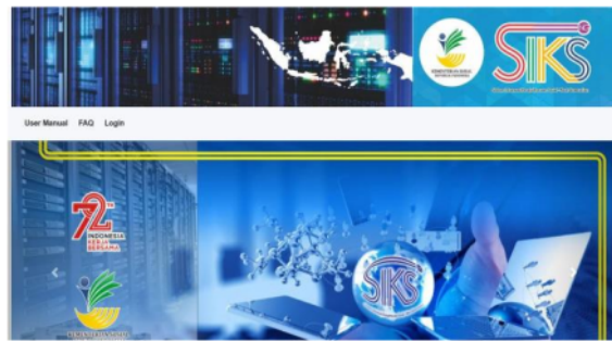
Figure 1: SIKS-GS Homepage

The SIKS-NG application is a management application for the process of improving and proposing new data in the Integrated Database (BDT). Regency/City Operators carry out the process of updating data through offline-based applications. The purpose of this application is to generate summary data, such as recapitulation. The GIS Web display also displays data on the results of improvements/proposals made by operators in offline-based applications. It processes them to produce a local Social Service Authorization Letter directly from the Application System. In addition, the results of updating each region will also be able to instantly download the file after the data is finalized for each period. It is also possible to transfer households between regions within one Regency/City. In figure 1, we can see the SIKS-GS Homepage.