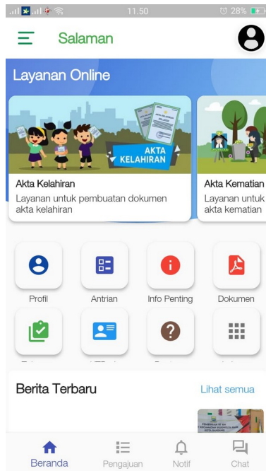
Figure 2. The Display of Salaman Application

From the picture above, you can see the facilities available in the Salaman application, which consist of : Profile Facilities , containing data on the user's family head and family members. Queuing Facility , contains data on the number of queues for online submissions. This data is updated every 5 minutes. Important Info , containing information on how to take a death certificate, a birth certificate. Printing of KTP-eL. Help ; contains information on new submissions, monitoring submissions, re-uploading files and printing demography documents. Criticisms and suggestions , containing input from users about the Salaman application service. FAQ , about frequently asked questions and answers. Office info , about the location (map) of the Bandung City Disdukcapil Office.