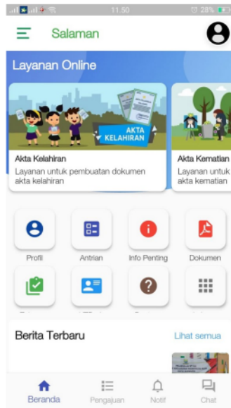
Figure 2. The Display of Salaman Application

From the picture above, you can see the facilities available in the Salaman application, which consist of : Profile Facilities , containing data on the user's family head and family members. Queuing Facility , contains data on the number of queues for online submissions. This data is updated every 5 minutes. Important Info , containing information on how to take a death certificate, a birth certificate. Printing of KTP-eL. Help ; contains information on new submissions, monitoring submissions, re-uploading files and printing demography documents. Criticisms and suggestions , containing input from users about the Salaman application service. FAQ , about frequently asked questions and answers. Office info , about the location (map) of the Bandung City Disdukcapil Office.