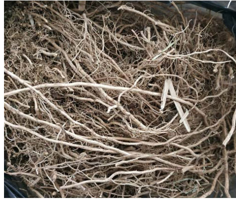
Fig. 1. Half-decomposed vetiver waste fertilizer.

vetiver waste fertilizer. Organic fertilizers have a significant impact to increase growth (See Table 3).