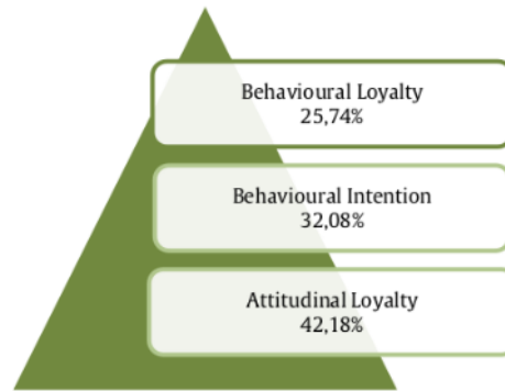
Figure 2: Responses of Indonesian Domestic Product Skincare Users in the SOCO Forum Regarding Brand Loyalty.

Brand loyalty is formed through the following dimensions: 1) attitudinal loyalty, 2) behavioral intention and 3) behavioral loyalty. Overall, the picture of brand loyalty among Indonesian domestic skincare users at the SOCO Forum is quite high. Figure 2 shows that the dimension that gets the highest score on brand loyalty is attitudinal loyalty with a percentage of 42.18% with an average score of 26.845, and the lowest score is behavioral loyalty which has a percentage of 25.74% with an average score. 16,385. This condition indicates that attitudinal loyalty has a higher level of value than behavioral intention and behavioral loyalty. This is in accordance with the statement (Gecti, & Zengin, 2013) that brand loyalty exists because the customer's attitudinal loyalty leads and has a large and strong impact on customer behavioral loyalty.