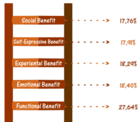
Figure 3: Responses of Indonesian Domestic Product Skincare Users in the SOCO Forum Regarding Brand Benefits

While brand benefits are formed through dimensions, including: 1) Functional benefits, 2) Emotional benefits, 3) Experiential benefits, 4) Self-expressive benefits, and 5) Social benefits. Overall, the picture of brand benefits for skincare reviewers Sariayu Martha Tilaar and Mustika Ratu at the SOCO Forum is quite high.