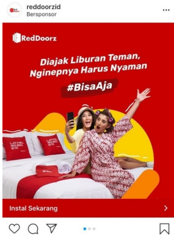
Figure 3. Reddoorz advertisement on Instagram

Figure 3, Reddorz also carries out online marketing strategies through advertisements on Instagram. This is done to get the attention of the customer who uses Instagram, which can be seen in Figure 4.