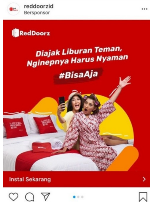
Figure 3. Reddoorz advertisement on Instagram

Figure 3, Reddorz also carries out online marketing strategies through advertisements on Instagram. This is done to get the attention of the customer who uses Instagram, which can be seen in Figure 4.