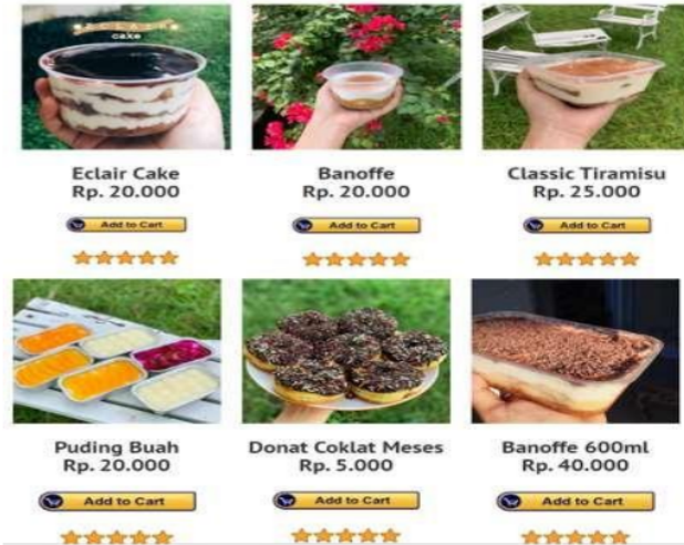
Fig. 2. Website Appearance

how well it meets user satisfaction (Barnes and Vidgen, 2001). This study's variables include user youth (usability), information quality (information quality), interaction quality, and user satisfaction. The summary of respondents' answers on the indicators for each variable can be seen in Table 1 to 3.