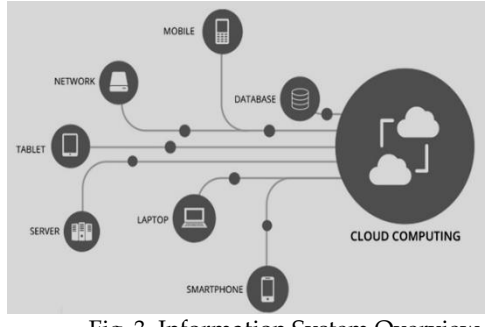
Fig. 3. Information System Overview

ware, brainware, databases, procedures, computer networks, and data communication. How the information system works involving several elements such as database, mobile, network, tablet, server, laptop, and smartphone can be seen in Figure 3.