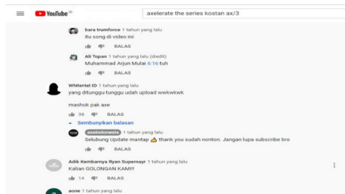
Figure 4. Comment replied by Axe . This figure was adopted from www.youtube.com/ on Oct 22 2019.

The use of digital media such as Youtube also certainly makes the brand more easily interact with consumers, the simple example is when the brand replied comment, this does seem trivial but it will make consumers feel more recognized so there is more closeness (See Figure 4).