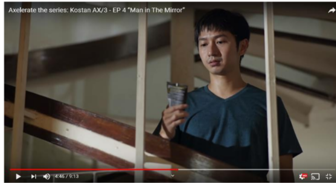
Figure 2. A scene from Axelerate the series: Kostan AX/3 . This figure was adapted from www.youtube.com on Oct 22, 2019.

packaged attractively so it doesn't bring a commercial impression. This can be seen from how the appearance of Axe products has not been highlighted since the beginning of the episode so it doesn't disturb the storyline (See Figure 2).