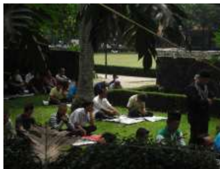
Figure 11. Tree attracted many people as a favorite place, though outside the territory of prayer

At the time of prayer, usually highly preferred that we keep the shafts uninterrupted. But along with the heat of the sun, jemaah tend to be clustered turns occupying relatively sheltered and not exposed to sunlight. The existence of spatial spaces formed was greatly influenced by the shadow of a tree or building mass.