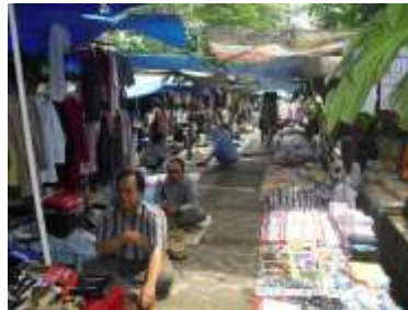
Figure 1. Prayer in the area of trade

With the time being and the need of mosque that can accommodate people activities, then the boundaries between the sacred and the profane is also growing. The need for economy, limitations and high prices of land, some communities make the mosque as well as a market on Fridays. Public space in the form of plazas and pavements even be used as trade territory. In this case there was a shift of meaning when used as a private public zone. More pronounced when the call to prayer starts to come, then it turned into a function room prayer area for traders. Private zone is not clear is even still traversed by pedestrians and shoppers who do not hesitate to choose the merchandise in front of people who are praying. The boundary between sacred space and profane become blurred. Of Amru bin Sy'aib ra: said, "Messenger of Allah forbade trading activities in the mosque." (Reported by Ahmad and Abu Daud in Musnadnya). When the space is used as a place of prayer, it means that space is running principle mosque, while trading activity is still running.