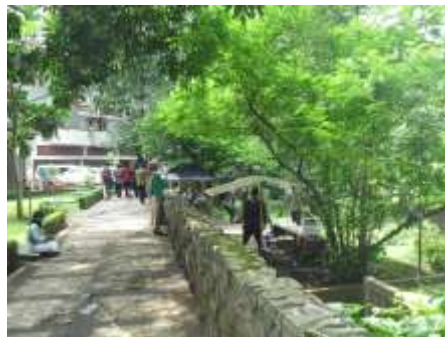
Figure 12. territory beggars

Field observations also found that the motivation of some people to come to the mosque during Friday prayers of worship is to become a beggar.