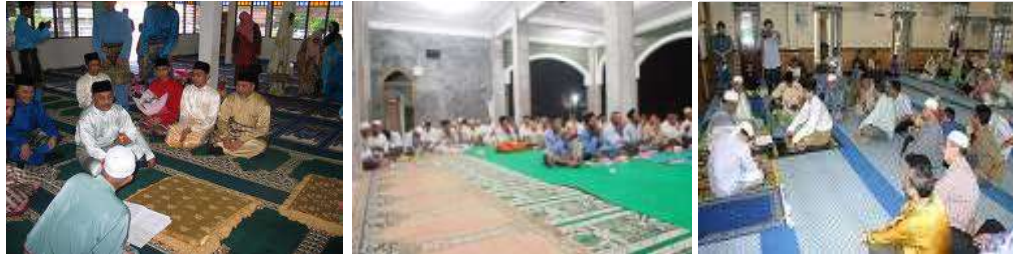
Figure 3. The mosque is used as the discussions, religious lectures, and even marriage

Some mosques have different policies. There is a main prayer room made purely as a place of prayer, and social activities and supportingspace put in outside places of worship. But some mosques even make the main prayer room as well as social venues such as: discussions, lectures and even wedding ceremonies. Sometimes, jemaah who wish to perform a ritual sunnah felt uncomfortable because of the existence of non-ritual activities. The main hall of prayer space pure as the main prayer room only during the hours of obligatory prayers. In this case there has been a shift in the meaning and the loss of clarity between the sacred and profane space.