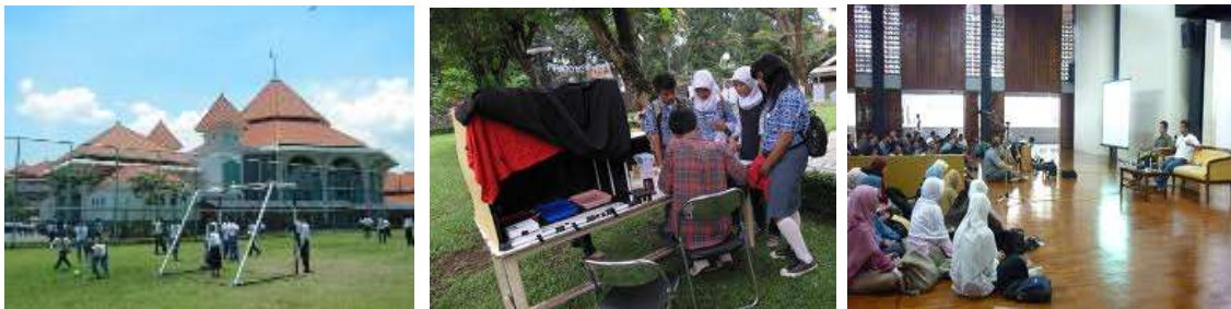
Figure 10. Informal education also marks the mosque's activities