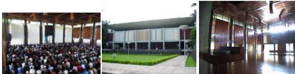
Figure 4. The main hall of prayer