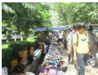
Figure 8. Personalize Merchants in marking their territory

At an informal space that forms every Friday, it created a permanent space that seemed to be agreement among the traders. The same trader will occupy the same space in the next week. Marking of these spaces as well as a constant reminder for visitors who are also diligent in visiting.