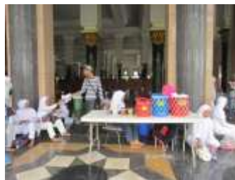
Figure 7. Dining area at the mosque