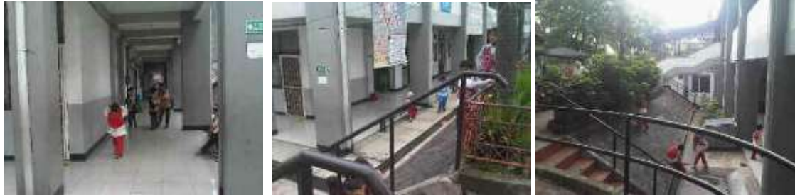
Figure 9. The mosque is united with the school

Besides trade, the mosque also often joined with the function of education, both formal and non formal education. The main activities in the mosque at the time of obligatory prayers will not be disturbed, in line with the regulations prohibiting mosques social activities conducted at the obligatory prayers. But this does not happen at the time of sunnah prayer activities. Congregation must be willing to share with school activities that sometimes doing activities that can reduce the concentration during prayer.