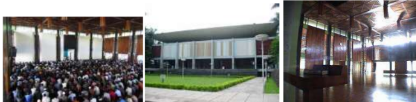
Figure 4. The main hall of prayer