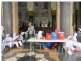
Figure 7. Dining area at the mosque