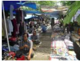
Figure 1. Prayer in the area of trade

With the time being and the need of mosque that can accommodate people activities, then the boundaries between the sacred and the profane is also growing. The need for economy, limitations and high prices of land, some communities make the mosque as well as a market on Fridays. Public space in the form of plazas and pavements even be used as trade territory. In this case there was a shift of meaning when used as a private public zone. More pronounced when the call to prayer starts to come, then it turned into a function room prayer area for traders. Private zone is not clear is even still traversed by pedestrians and shoppers who do not hesitate to choose the merchandise in front of people who are praying. The boundary between sacred space and profane become blurred. Of Amru bin Sy'aib ra: said, "Messenger of Allah forbade trading activities in the mosque." (Reported by Ahmad and Abu Daud in Musnadnya). When the space is used as a place of prayer, it means that space is running principle mosque, while trading activity is still running.