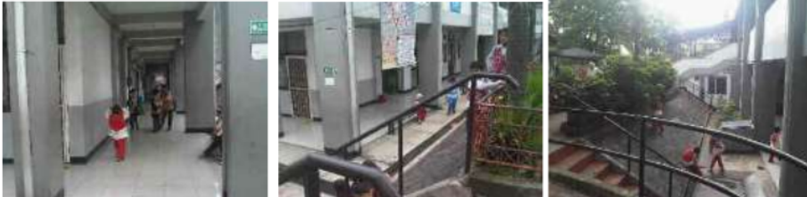
Figure 9. The mosque is united with the school

Besides trade, the mosque also often joined with the function of education, both formal and non formal education. The main activities in the mosque at the time of obligatory prayers will not be disturbed, in line with the regulations prohibiting mosques social activities conducted at the obligatory prayers. But this does not happen at the time of sunnah prayer activities. Congregation must be willing to share with school activities that sometimes doing activities that can reduce the concentration during prayer.