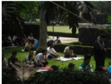
Figure 11. Tree attracted many people as a favorite place, though outside the territory of prayer

At the time of prayer, usually highly preferred that we keep the shafts uninterrupted. But along with the heat of the sun, jemaah tend to be clustered turns occupying relatively sheltered and not exposed to sunlight. The existence of spatial spaces formed was greatly influenced by the shadow of a tree or building mass.