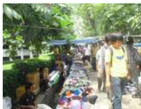
Figure 8. Personalize Merchants in marking their territory

At an informal space that forms every Friday, it created a permanent space that seemed to be agreement among the traders. The same trader will occupy the same space in the next week. Marking of these spaces as well as a constant reminder for visitors who are also diligent in visiting.