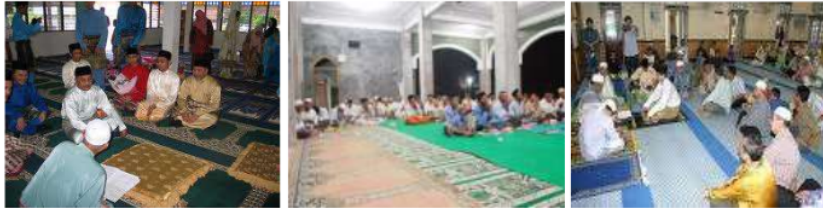
Figure 3. The mosque is used as the discussions, religious lectures, and even marriage

Some mosques have different policies. There is a main prayer room made purely as a place of prayer, and social activities and supporting space put in outside places of worship. But some mosques even make the main prayer room as well as social venues such as: discussions, lectures and even wedding ceremonies. Sometimes, jemaah who wish to perform a ritual sunnah felt uncomfortable because of the existence of non-ritual activities. The main hall of prayer space pure as the main prayer room only during the hours of obligatory prayers. In this case there has been a shift in the meaning and the loss of clarity between the sacred and profane space.