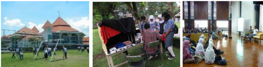
Figure 10. Informal education also marks the mosque's activities