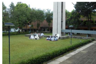
2a. The use of space for the high-school age community.