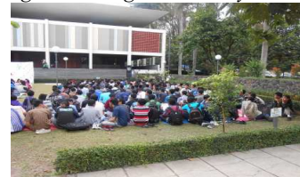
2d. Space can also be used by the campus community of ITB.