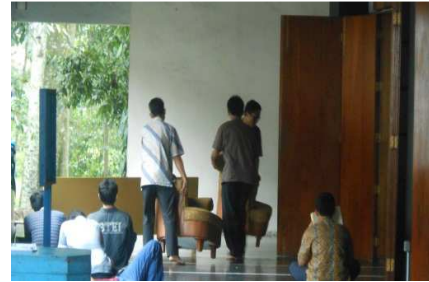
3b. The recitation community takes time out to arrange chairs for a discussion program.