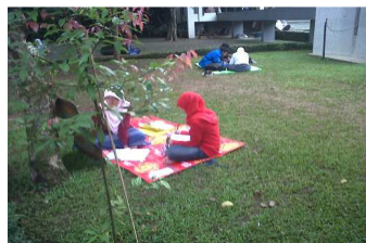
2b. The use of space for junior high school age community