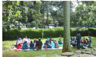
2c. The use of space by the community of women recitating the holy Quran