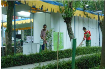
3a. Dormitory residents take time out in the morning to sweep the yard.

The influence on the community in the Salman Mosque is marked by the emergence of the feeling that they have a role to play at the mosque according to each individual interest, ability, and time available. The community is dominated by college students who come not only from ITB, but also from other campuses in Bandung. This condition enables the community to share roles since the members come from different backgrounds.