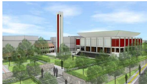
1b. Simplicity mixed with landscape