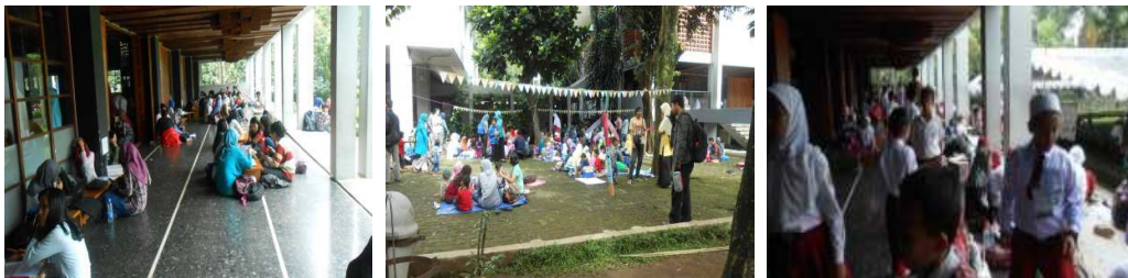
Figure 4. Social acts that allow the intertwining of cross-generational

In the meantime, the established emotional relationship can occur between generations. The generation gap that occurs outside the community can disappear within the mosque compound. The respectful calling such as “Sir”, “Mam”, or other campus title such as “Prof”, becomes equal to calling “(a)kang” (brother in local language) and “tete” (sister in local language). Inter-generational close contact is always conducted during various activities as seen in figure 4. The historical value of Salman mosque is shared in mentoring and cadre training routinely conducted by the community in the formal and informal activities. Sharing participation in activities is always conducted by the member of the community. For example, when PAS community, a community deals with development and dakwah (teaching the application of the holy Qoran) for children of kindergarten and elementary school age groups is conducting their activities, members of other community are willing to help. In 2015, there were 40 communities within the Salman compound supervised by 5 divisions. The type and variety of community are expected to grow from time to time.