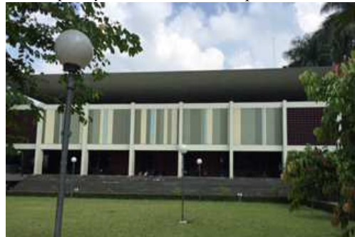
1c. Color gradation to accentuate the façade of the building