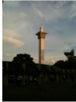
Figure 24: Still the same tower.