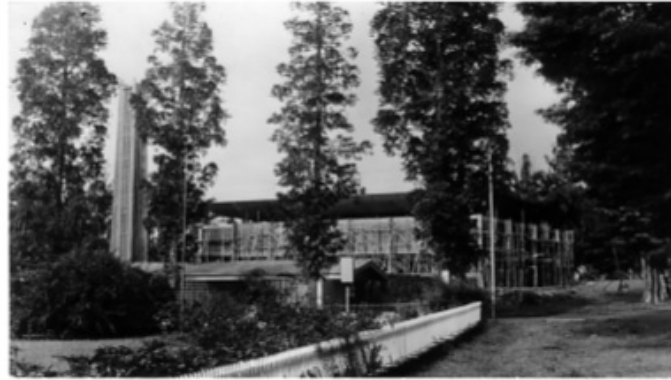
Figure 4: Façade of Salman Mosque, 2002. YPM Salman ITB Collection, 2002