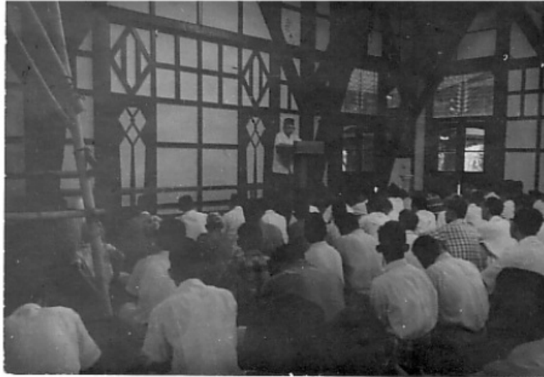
Figure 2: Friday prayer at Aula Barat ITB YPM Salman ITB Collection, 1960

While waiting for the construction of Salman Mosque who was finally allowed through a very long process, a simple building was made to hold religious activities of ITB campus temporarily. On 22 June 1965, the Salman Mosque tower was inaugurated as the milestone of the construction of the Salman Mosque where the fund raising was still in progress. The location was a corn field by Ganesha Street, near the ITB campus. The tower was first to be constructed due to insufficient funds available to construct a mosque.