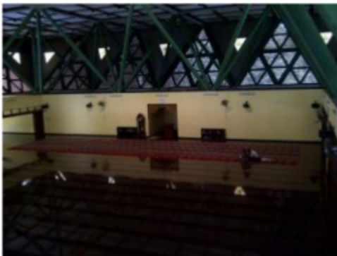
Figure 13: Main room and the mihrab. Private Collection 2011.