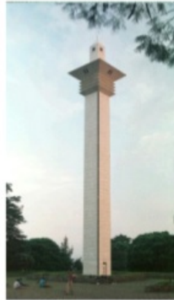
Figure 23: Tower by Ahmad Noeman Masjid 2000 Collection, seri Pulau Jawa.