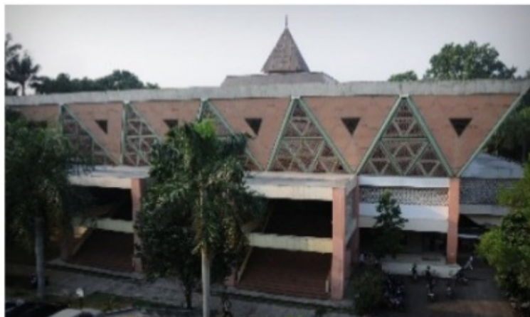
Figure 12: Façade of Al Hurriyyah Campus Mosque, Bogor Agricultural University, Baranangsiang, Indonesia.

Technology still seems to dominate the spirit of other work of Ahmad Noeman: the Al Hurriyyah mosque. The mosque is located in a natural area located on the farm campus. This three-storey mosque can accommodate over five thousand worshippers. Currently, the most often functioned as a place of prayer is the second and third floors. Especially the third floor which is the mezzanine floor reserved for female worshippers. Second floor acts as the main floor of this mosque. There are a number of rooms on the second floor, each of which is named after the first four caliphs. On the left side of the sanctuary, there is a space Ali, Uthman adjacent to the space. On the right side there is a mihrab Abu Bakr. Meanwhile on the ground floor there is a vast place of ablution and lobby which is used as a place to sell books, food and Islamic products.