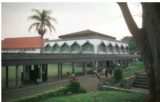
Figure 17: Mosque on the year 2000. Masjid 2000 Collection, seri Pulau Jawa