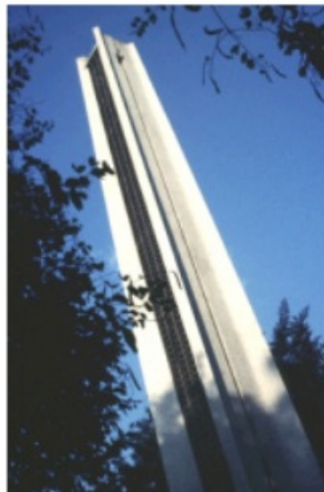
Figure 8: Minaret as a signage. Masjid 2000 Collection, seri 1: Pulau Jawa.

Because of the unusual shape of the building at that time, the only marker in the mosque is the tower ( minaret ). In addition to a marker region, the tower also serves to broaden the reach of the call to prayer. In the current context, the tower also serves as a means of exercise climbing wall for the youth. This minaret appeared in simple form, harmonious with the mosque facade. (Figure 8).