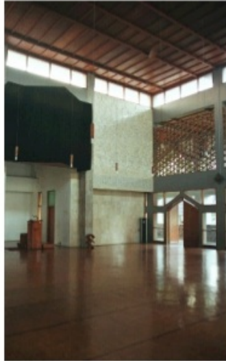
Figure 21: Interior by Ahmad Noeman Masjid 2000 Collection, seri Pulau Jawa.