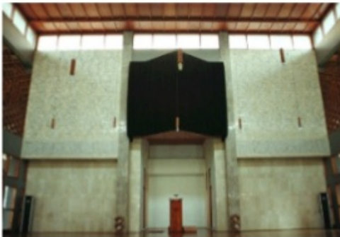
Figure 25: Mihrab Al Furqon by Ahmad Noeman. Masjid 2000. Collection, seri Pulau Jawa.