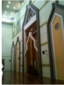
Figure 28: Interior wall by Fauzan Noeman. Aditya, Nova Chandra Collection 2011.