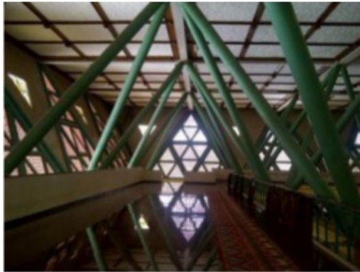
Figure 16: Mezanine floor in the space structure, as prayer room for women. Private Collection 2011.