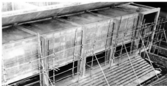
Figure 5: Curved roof that also serves as the rainwater channel.

Women's prayer rooms are placed on the back, in times when full capacity reached, a mezzanine is provided upstairs. The views will be maintained, but protected against the congregation of men. Separation was performed with a flexible low barrier. If the congregation is full of men, the women moved to the mezzanine. At first, the mosque accepts women on Friday worship. Along with the quantity of male congregation are getting bigger, the women are no longer be able to worship on Friday. Priorities are preferred to men in accordance with the Qu'ran.