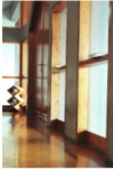
Figure 27: Interior wall by Ahmad Noeman. Masjid 2000 Collection, seri Pulau Jawa.