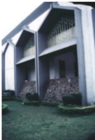
Figure 19: Triangle geometric openings by Ahmad Noeman Masjid 2000 Collection, seri Pulau Jawa.