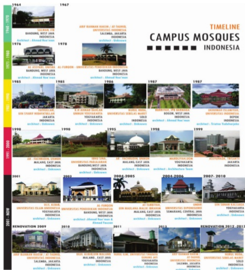
Figure 11: Timeline development of Campus Mosque in Jawa, Indonesia. Dewiyanti, Dhini. 2013

Figure 11 shows the development of campus mosques in Indonesia. The presence of mosque in educational areas was seldom encountered in the 1960s, and became plentiful in 2000s. Due to the limited display of figures, only a few mosques can be displayed. A number of mosques in campus areas, were designed by Ahmad