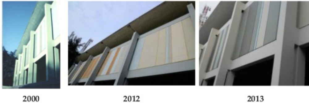
Figure 7: Gradual changes in façade color

Because of the unusual shape of the building at that time, the only marker in the mosque is the tower ( minaret ). In addition to a marker region, the tower also serves to broaden the reach of the call to prayer. In the current context, the tower also serves as a means of exercise climbing wall for the youth. This minaret appeared in simple form, harmonious with the mosque facade. (Figure 8).