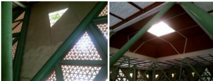
Figure 15: Lighting in the form of massive-transparent in triangle form Private Collection 2011.

The mezzanine floor as the top floor, remains functional used as a prayer room for women. The composition of the structures, materials, colors, and shadows, provide an experience of its own space especially for women pilgrims who are usually given a closed chamber (Figure 16).