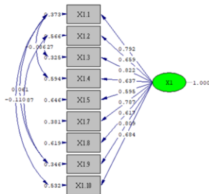
Chi-Square=55.86, df=22, P-value=0.00009, RMSEA=0.074