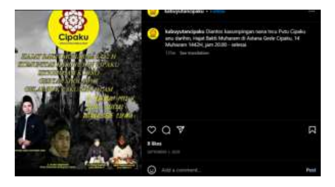
Fig. 6. Posts about the Islamic New Year Commemoration of Muharram at the Dam location

The use of social media in preserving local cultural values has an important role in strengthening the identity and sustainability of a community's cultural heritage, including the Cipaku Cultural Community, where Cipaku is not just a village or geographical area, but more of a culture or tradition. Social media provides an effective means of disseminating information, educating and promoting local cultural diversity to a wider audience.