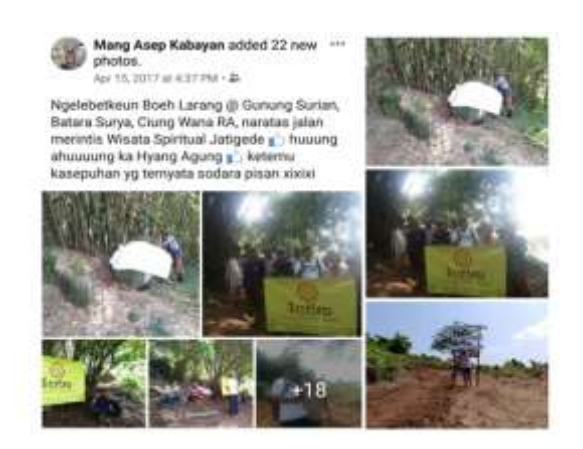
Fig. 3. Jatigede Spiritual Tourism Information on the Kabuyutan Cipaku weblog

Communities use blogs as a vehicle for interaction, sharing information about activities carried out by the community and involving groups outside the community. For this community, blogs are alternative media that are able to reach a wider target audience. Through blogs they also open up space for discussions with the community in order to optimize the work programs created.