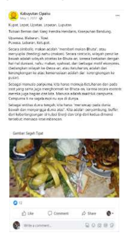
Fig. 4. Writing from a cultural figure on the Kabuyutan Cipaku Facebook account

Facebook fanpage is a social network that provides a network for blogs to spread their posts, but can also create separate posts for Facebook audiences without connecting to the blog link. In utilizing the social media Facebook, the Kabuyutan Cipaku Facebook fanpage is more active in posting compared to blogs. Some of the articles on the blog were rewritten on the Facebook fan page. With 2,500 likes and 2,700 followers, it shows that the Kabuyutan Cipaku Facebook fanpage is quite active and the comments are interactive so it is attractive to the public.