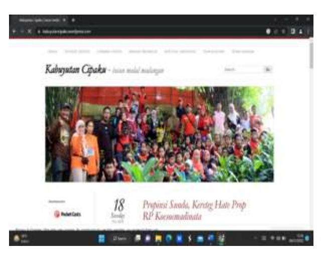
Fig. 1. Wordpress account kabuyutancipaku.wordpress.com