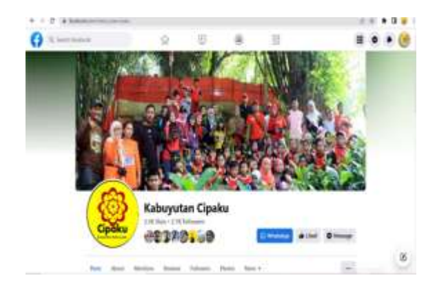
Fig. 3. Kabuyutan Cipaku Facebook: https://www.facebook.com/kabuyutancipaku