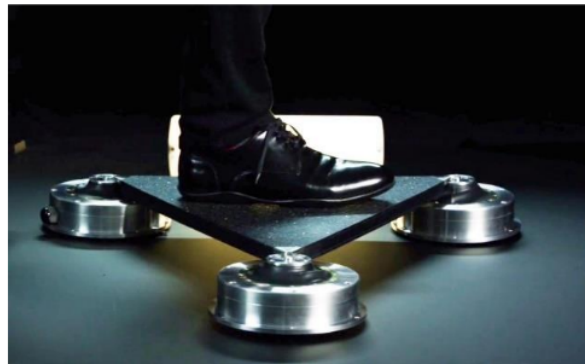
Figure 2. Detail of Kinetic Paving

Paving kinetic is also a substitute for energy from non-renewable natural resources. Although not as a whole, minimizing will be better. So that CO 2 emissions will be reduced and air pollution will be reduced. Transformed energy can also be additional energy for outdoor facilities or buildings. With the existence of kinetic paving, it becomes a source of public education to encourage people to walk more frequently instead of using vehicles ineffectively and producing more CO 2 emissions. Kinetic paving is also a sustainable material so it can be used in a very long term as a technological marker of highly advanced kinetic paving (See Figure 3).