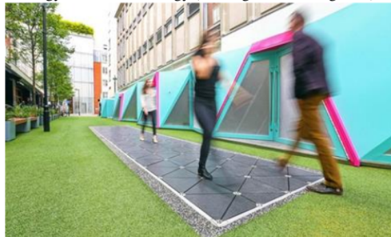
Figure 1. Kinetic Paving in the street

Paving kinetic when viewed on environmental aspects, there are many positive aspects. Starting from the energy source, namely the power from the footrest that previously did not mean anything, but after the existence of this paving kinetic technology, the power from the footing is very meaningful because of the source of kinetic energy for this technology (See Figure 1 and Figure 2).