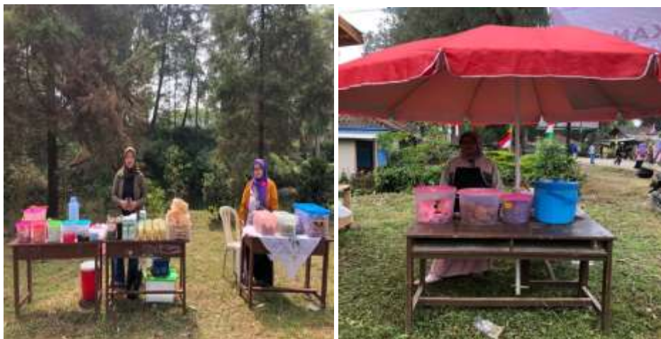
Figure 1. UMKM Santosa Village

The following is a picture of UMKM Santosa Village: