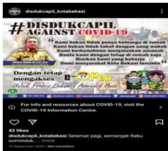
Figure 2. Dissemination of the E-OPEN application through the Bekasi City Disdukcapil Instagram

Figure 2 show that the Bekasi City Population and Civil Registration Service has conducted socialization of policies on the E-OPEN application through Instagram social media. However, judging from the number of likes in the image, there was a lack of response from the people of Bekasi City regarding the socialization image. This shows that there are still many Bekasi City residents who are not aware of the existence of the E-OPEN application. Based on the results of observations made by researchers, the socialization of policies carried out by the Bekasi City Disdukcapil regarding the E-OPEN application through Intsagram was less effective. Because if you look at the response you got on the posting page, there are still many Bekasi City residents who are not aware of the existence of the post, which has resulted in the lack of success in socializing the policy on the E-OPEN application. And it also has an impact on the lack of delivery of information regarding this policy to the people of Bekasi City so that many people of Bekasi City say that the community does not yet know clearly about the existence of a policy on the E-OPEN application.