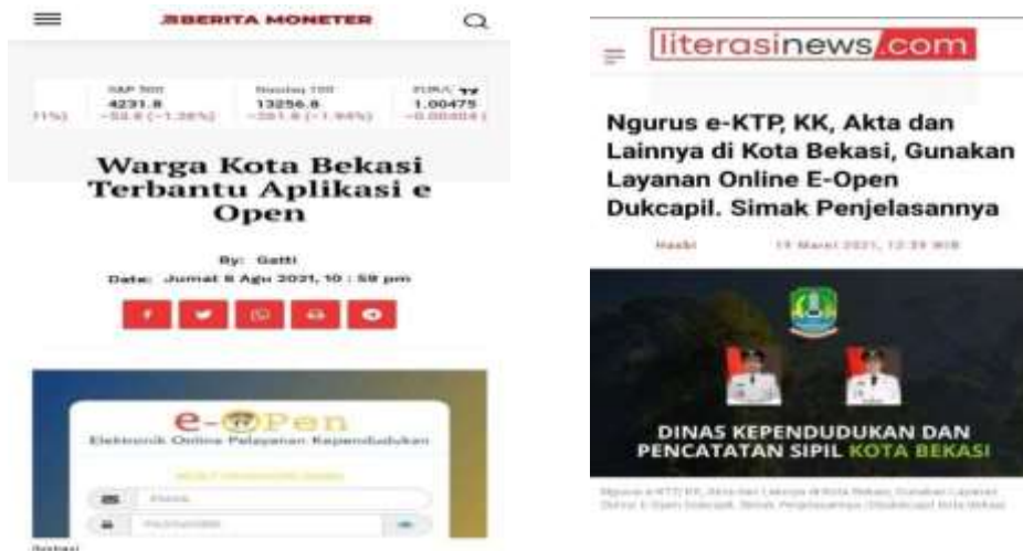
Figure 1. Electronic Media reports about the E-OPEN application

The mass media has a great influence on society to socialize different values and norms. Society generally agrees that the role of the mass media in everyday life is so great that most of what people do comes from the mass media. The things that come out of the mass media are also part of the values that apply to society. Therefore, the mass media is referred to as one of the agents of socialization. In the process of socialization by the mass media, everyone has an impact on knowledge about values and standards of living that are different. In this process, one becomes aware of what cannot be done, what can be done and what needs to be done to build a better society. In this case, the mass media is influential in the socialization process of E-Government policies regarding the application of Electronic Online Services (E-OPEN). Based on observations made in the field by researchers, the Bekasi City Population and Civil Registration Service in disseminating E-Government policies through the E-OPEN application, is more focused on disseminating these policies through social media and there are only a few electronic media such as articles discussing the existence of policies in the E-OPEN application.