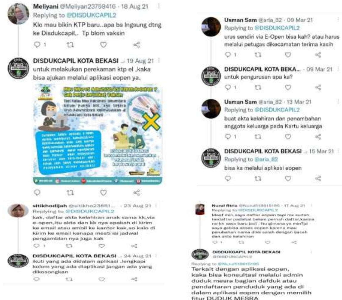
Figure 4. Public Responses to Twitter Posts related to the E-OPEN Application

Based on figure 3 shows that the Bekasi City Population and Civil Registration Office has socialized the E-OPEN application through Twitter social media. And if you look at the two social media that have been used by the Bekasi City Disdukcapil, the number of community responses to socialization posts for the E-OPEN application looks much larger. Based on the results of observations made by researchers, the socialization carried out by the Bekasi City Population and Civil Registration Service regarding the E-OPEN application policy through social media Twitter, the response received from the people of Bekasi City has increased. Judging from the number of responses from the two posts, several residents of Bekasi City are already aware of the existence of the E-OPEN application through the two posts. The following figure 4 shows some of the public's responses regarding the two posts: