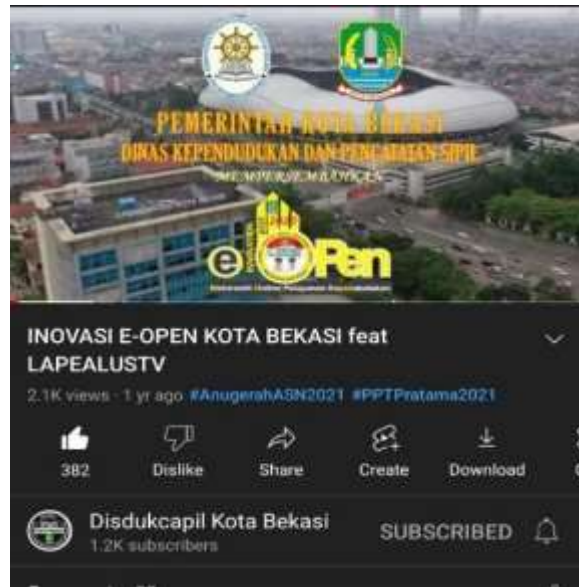
Figure 5. Socialization of the E-OPEN application through the Youtube channel Disdukcapil Bekasi City

Figure 5 shows that, the Bekasi City Population and Civil Registration Office has collaborated through LAPEALUSTV to socialize the E-OPEN application. Then, when viewed from the number of views obtained on the socialization video posted via the Disdukcapil YouTube channel for the City of Bekasi, it shows that more people are interested in information about the E-OPEN application. Based on the researchers' observations while in the field, according to the public's view of the socialization of policies carried out by the Bekasi City Disdukcapil regarding the E-OPEN application through social media, it is less influential in socializing the policy, because not all members of the public understand and understand how to use social media. Apart from that, when viewed based on the level of human resources, the community is of the view that not all people can afford to buy or have cell phones so that this can hinder the course of policy socialization regarding the E-OPEN application.