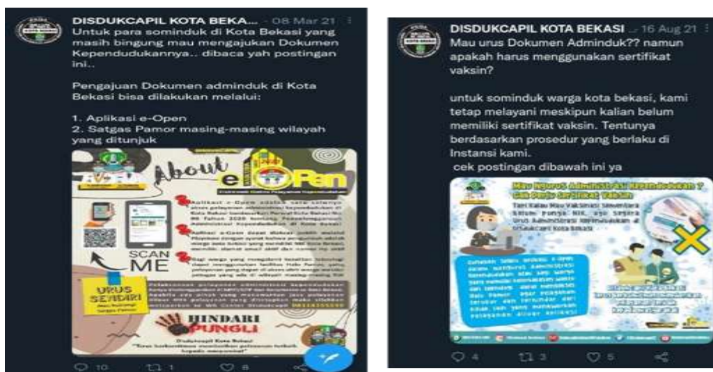
Figure 3. Dissemination of the E-OPEN application through the Bekasi City Disdukcapil Twitter

Figure 2 show that the Bekasi City Population and Civil Registration Service has conducted socialization of policies on the E-OPEN application through Instagram social media. However, judging from the number of likes in the image, there was a lack of response from the people of Bekasi City regarding the socialization image. This shows that there are still many Bekasi City residents who are not aware of the existence of the E-OPEN application. Based on the results of observations made by researchers, the socialization of policies carried out by the Bekasi City Disdukcapil regarding the E-OPEN application through Intsagram was less effective. Because if you look at the response you got on the posting page, there are still many Bekasi City residents who are not aware of the existence of the post, which has resulted in the lack of success in socializing the policy on the E-OPEN application. And it also has an impact on the lack of delivery of information regarding this policy to the people of Bekasi City so that many people of Bekasi City say that the community does not yet know clearly about the existence of a policy on the E-OPEN application.